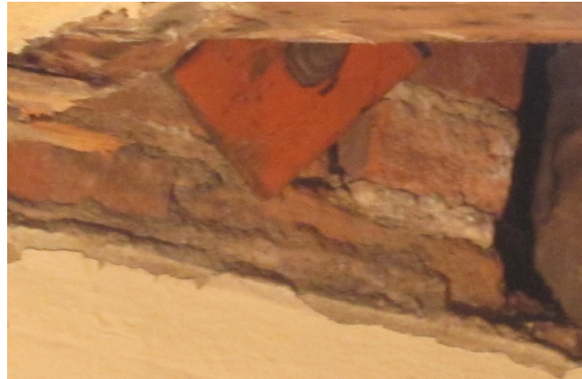
Metal plate exposed during grand stair work, July 2014.

As has often been the case, the Annual Report must focus at least in part on the construction in the building, some of which you may have yourself experienced. In summer 2013 the major project involved repair of the lantern/skylight which had been silently leaking for some time. Evidence of this could be discovered by examining the southeast corner of the ceiling of the Grand Stair where moisture had slowly and repeatedly defaced the plaster molding so that the details were blurred beyond recognition. Finding the exact source of this moisture penetration took some detective work by our roofers, but eventually the Superintendence Committee felt secure in undertaking the repair project. The construction took several months, but at the end we hoped that the moisture penetration was remedied. The Athenaeum also restored the chandelier at the same time. However, although it was clear that the walls of the Grand Stair also required re-plastering and re-painting, the Superintendence Committee wisely decided to wait to be sure that all leaks had been removed. After the hard winter we hired roofers to probe the southeast corner to make sure that no moisture could be detected. After they assured us that they could discover no new moisture intrusions, it was time to consider the wall repair work. In May 2014 the Special Appeal went out to support this project,