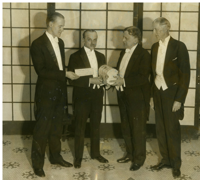
Paul Cret receives the 1930 Philadelphia award. Connie Mack, is on the right.