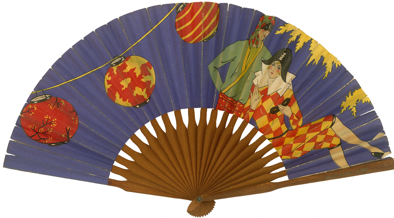
Early twentieth century folding fan with printed paper leaf and wood frame, advertising the Red Star Line transatlantic passenger ship company.