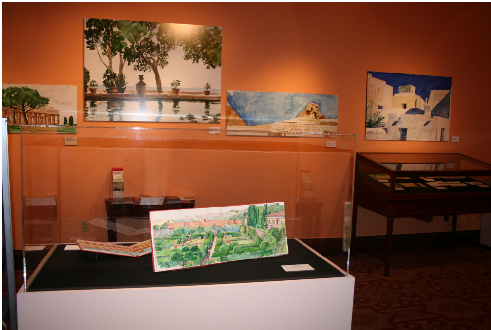
Laurie Olin: Sketchbooks from the Mediterranean exhibition.

The Fiscal Year 2013/14 not only provided occasions for our usual packed schedule of programming, but also launched the Athenæum's celebration of its 200 th Anniversary. Fall's exhibition offering was accomplished with the assistance of Athenæum stockholder and renowned landscape architect Laurie Olin, who consented to showing his travel sketchbooks in our Haas gallery. Laurie Olin: Sketchbooks from the Mediterranean was accompanied by a gallery talk in October, as well as the remarks that Mr. Olin made on the evening of the opening.