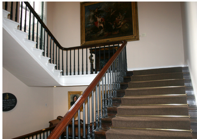
Finished grand stair work.