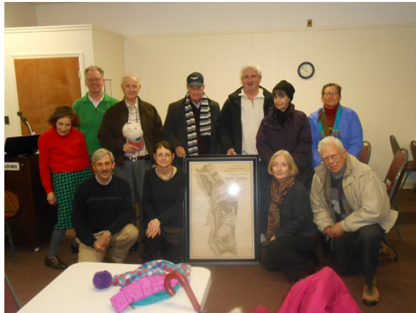
Point Breeze archaeological tour group.

The symposium also marked the move of the Bonaparte Collection from the back hall of the Athenæum into a room which at one point was titled the “Bonaparte Parlor.” This places the exhibition directly across from the Haas Gallery where the Athenæum’s changing exhibitions occur and consolidates our exhibition