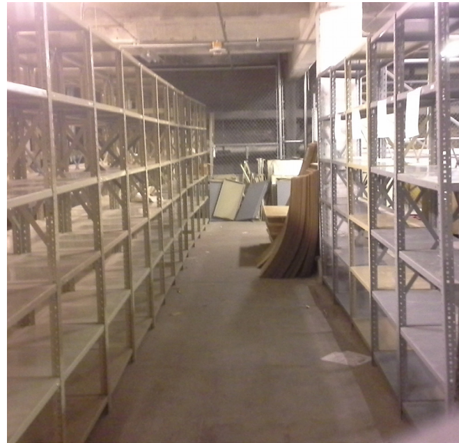
Empty shelves in the Athenæum's Penn Mutual storage area.

After more than two decades in the Penn Mutual Towers, the Athenæum consolidated its off-site storage in newer, cleaner, and climate-controlled facilities in New Castle, Delaware. The move took more than six weeks in May and June and was accomplished with 5 Athenæum staff, 12 professional movers, 5 visits, 11 trucks, and lots of hard work. In all, over 5000 cubic feet of historic collections were transferred, more than half of the Athenæum's architectural collections. The items now stored in Delaware are still available for research. Some of the collections now stored off-site include the AIA Philadelphia Chapter, Cret, Durham, Dagit, D'Ascenzo, Dickey, Hayes & Hough, Lovatt, Magaziner, Price & McLanahan, Rankin & Kellogg, Wanamaker, and others. Please contact Curator of Architecture Bruce Laverty in advance to determine if the items you need to review are off-site and to schedule an appointment.