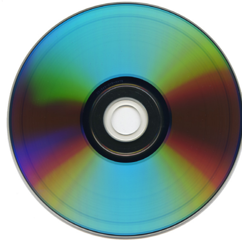
The dark ring about a half inch from the outer edge is a sure sign of bad tracks on this disk.